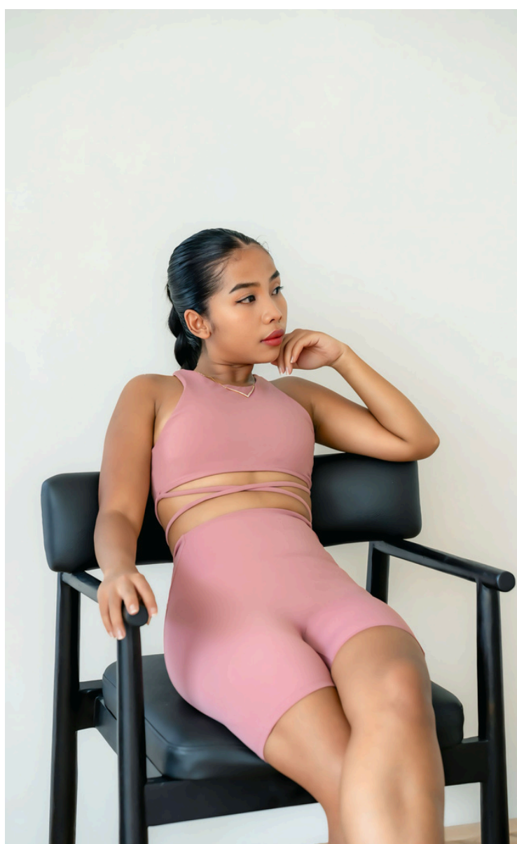
NICKY RACER BACK TOP SIZE : XS - L