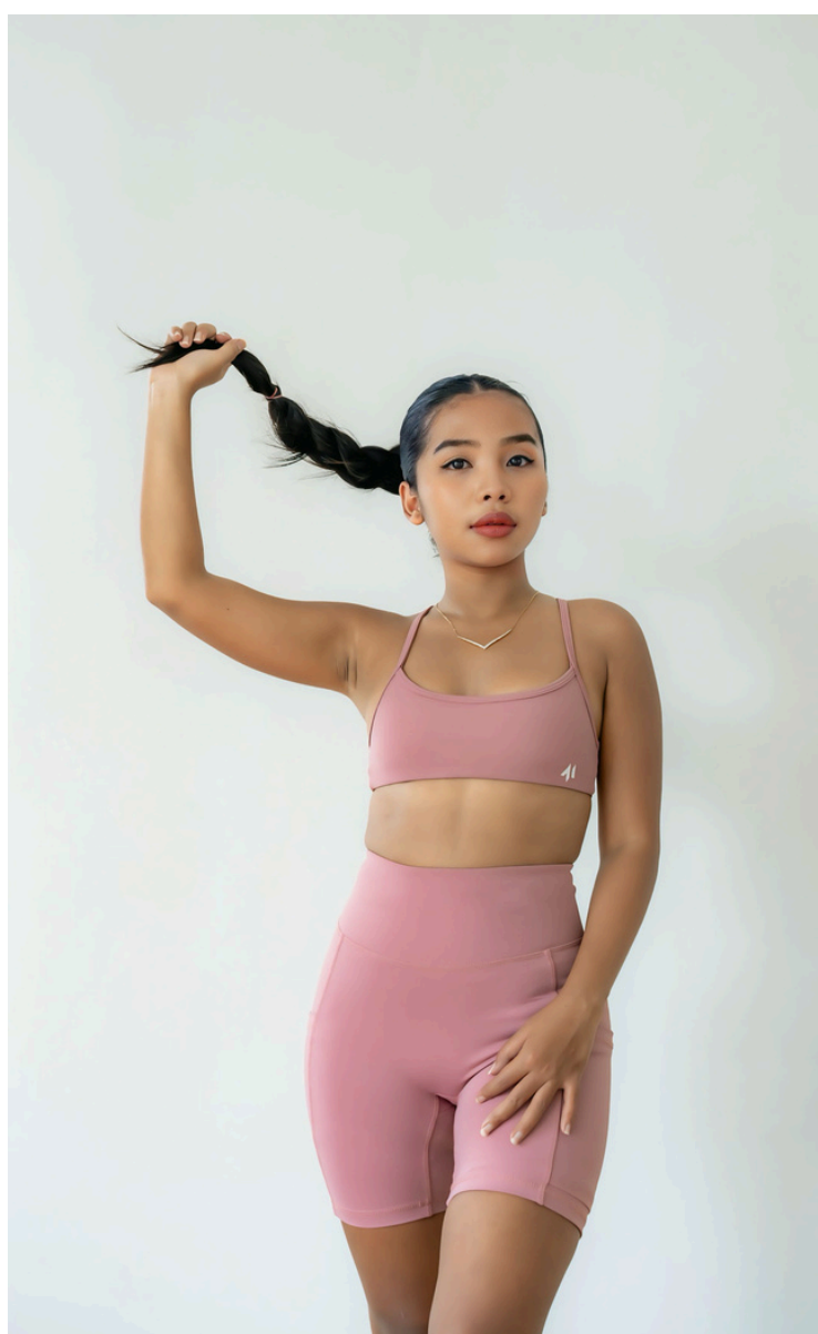
JACKY STRAPPY TOP SIZE : XS - L