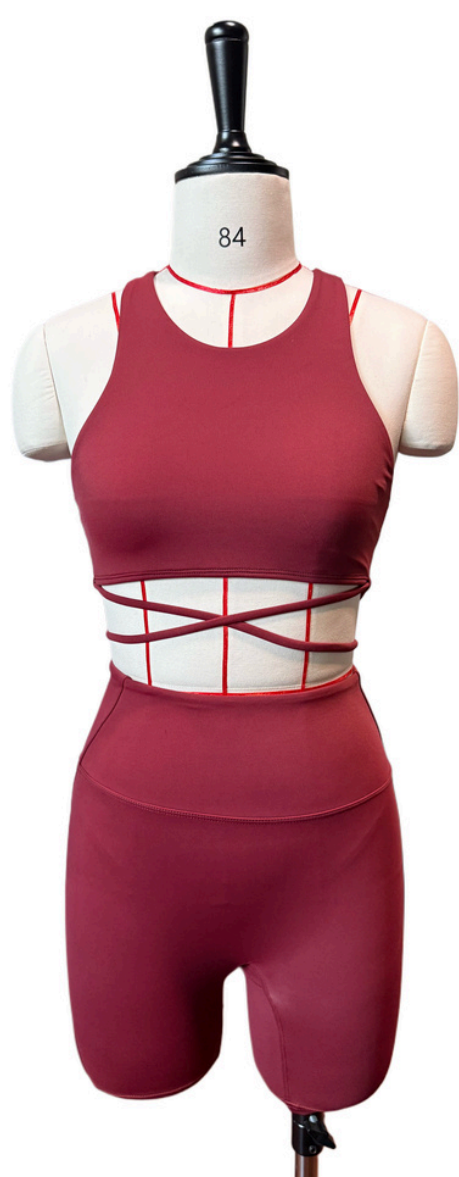
NICKY RACER BACK TOP SIZE : XS - L