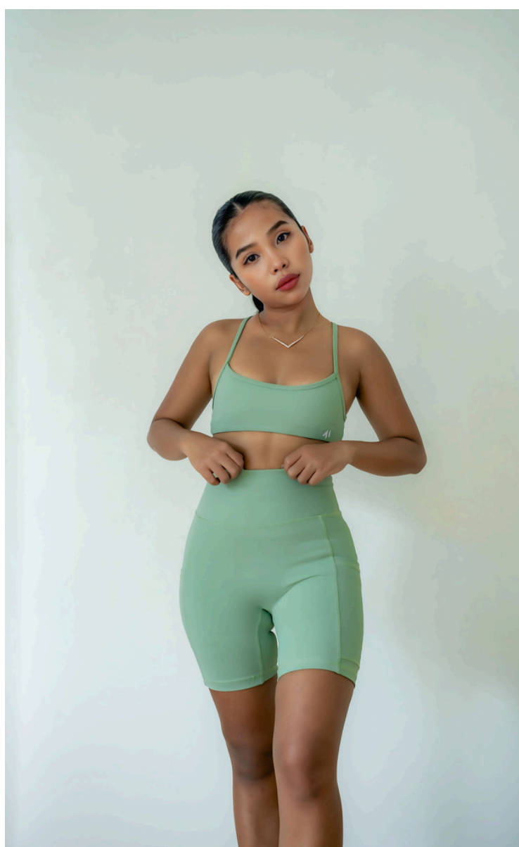
JACKY STRAPPY TOP SIZE : XS - L