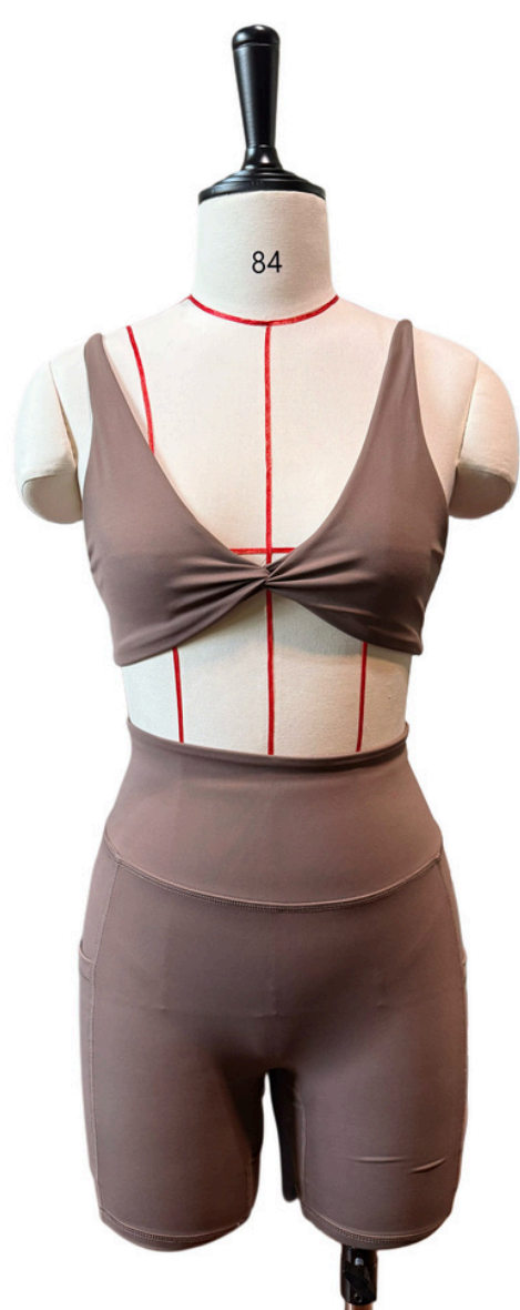
ATIKA TWIST TOP SIZE : XS - L